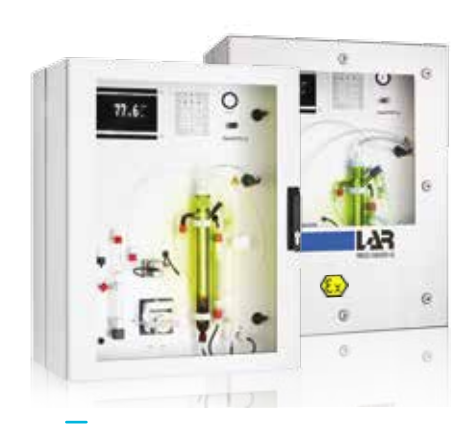
Fast and safe - you can rely on QuickTOC<sub>uv</sub>!

The QuickTOC<sub>uv</sub>, manufactured by LAR Process Analysers, is a measuring device for continuous online determination of total carbon (TC) and total organic carbon (TOC) in pure water, e.g. condensate return and boiler feed water.